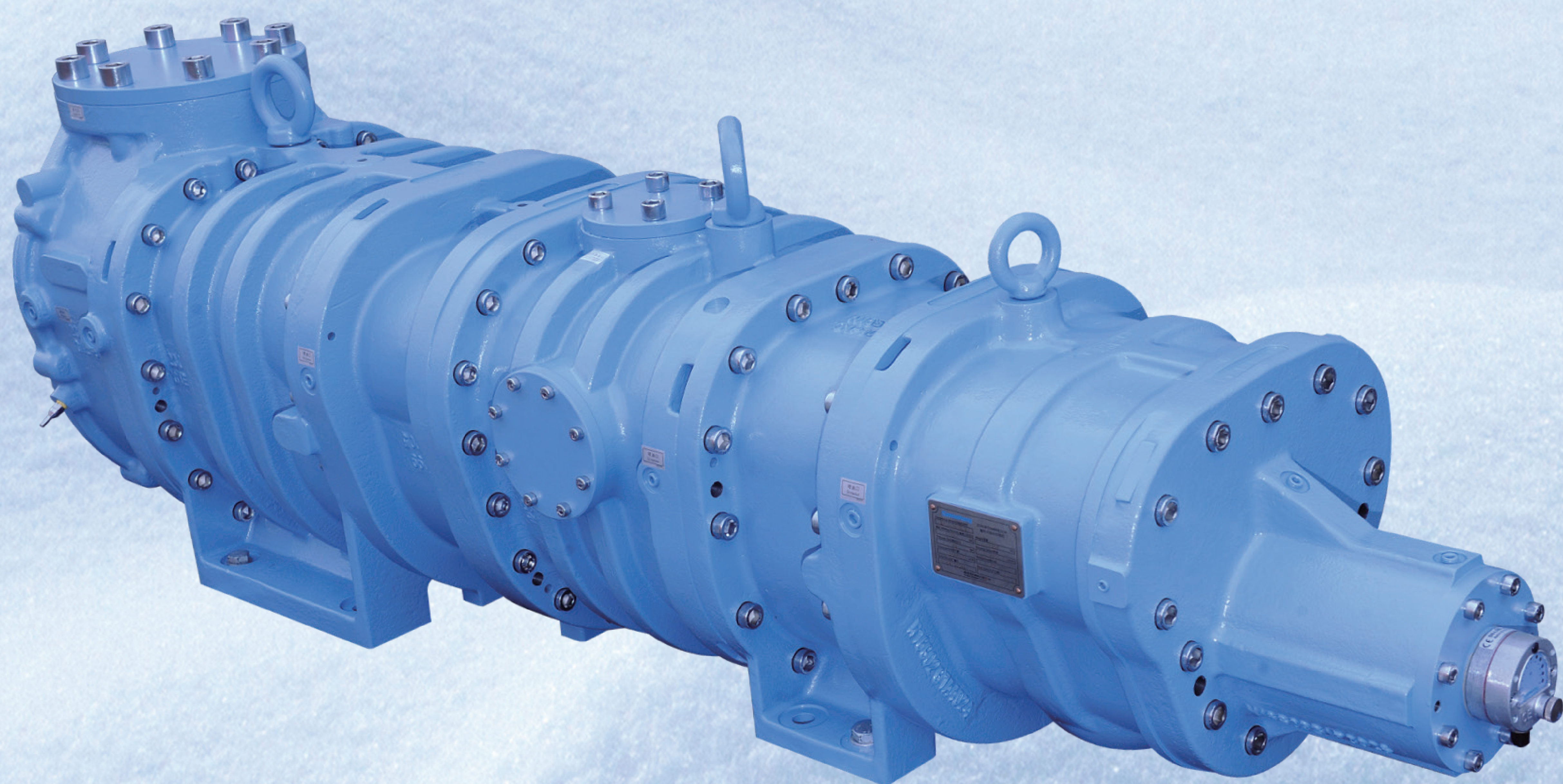
SRM - 2016 Series SRM Open type screw compressor Two stage series