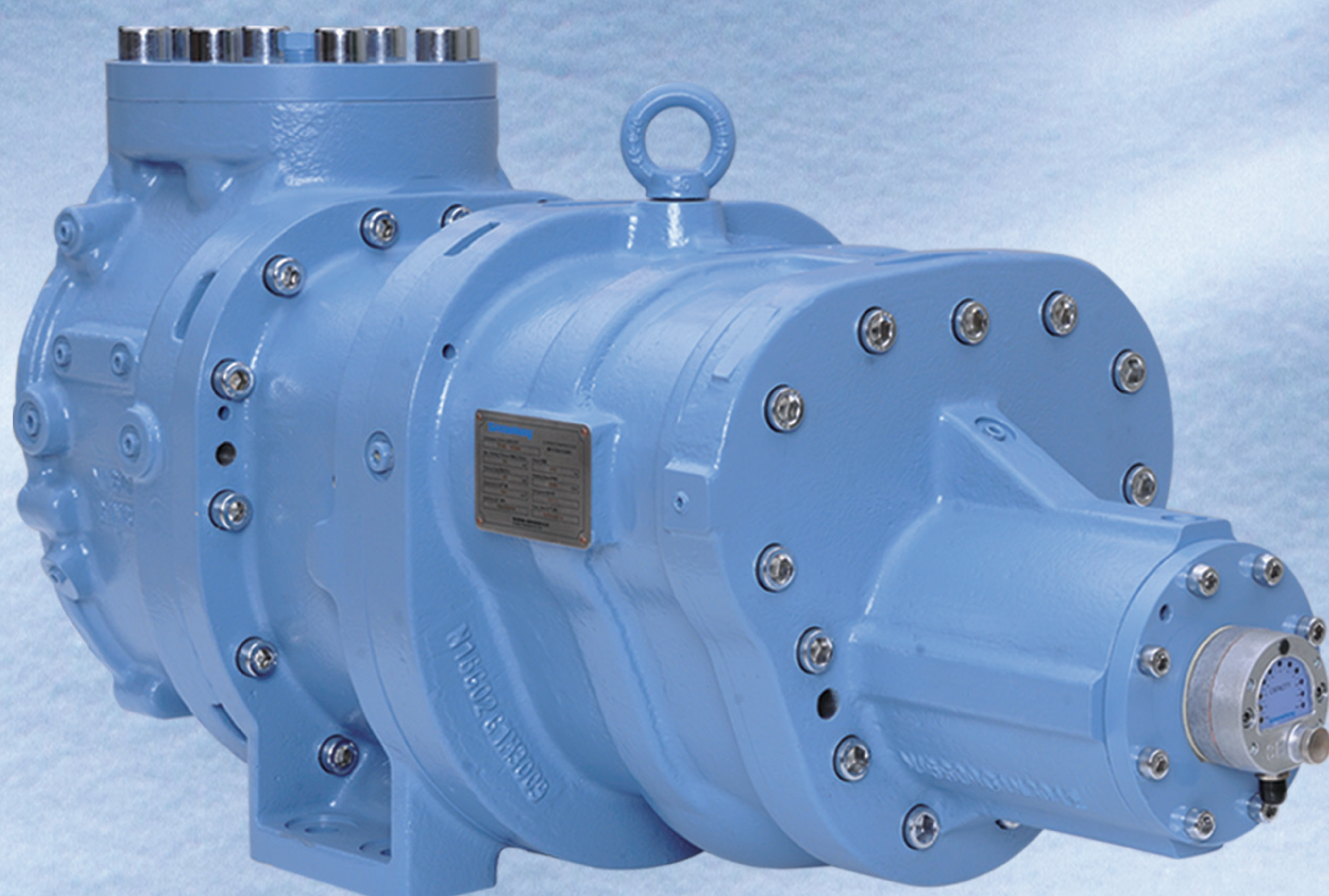
SRM - 16 Series SRM Open type screw compressor Single stage series

The inventor and Leader of Screw Compressor Technology 100-year Legacy of Technical Quality and Energy Efficiency